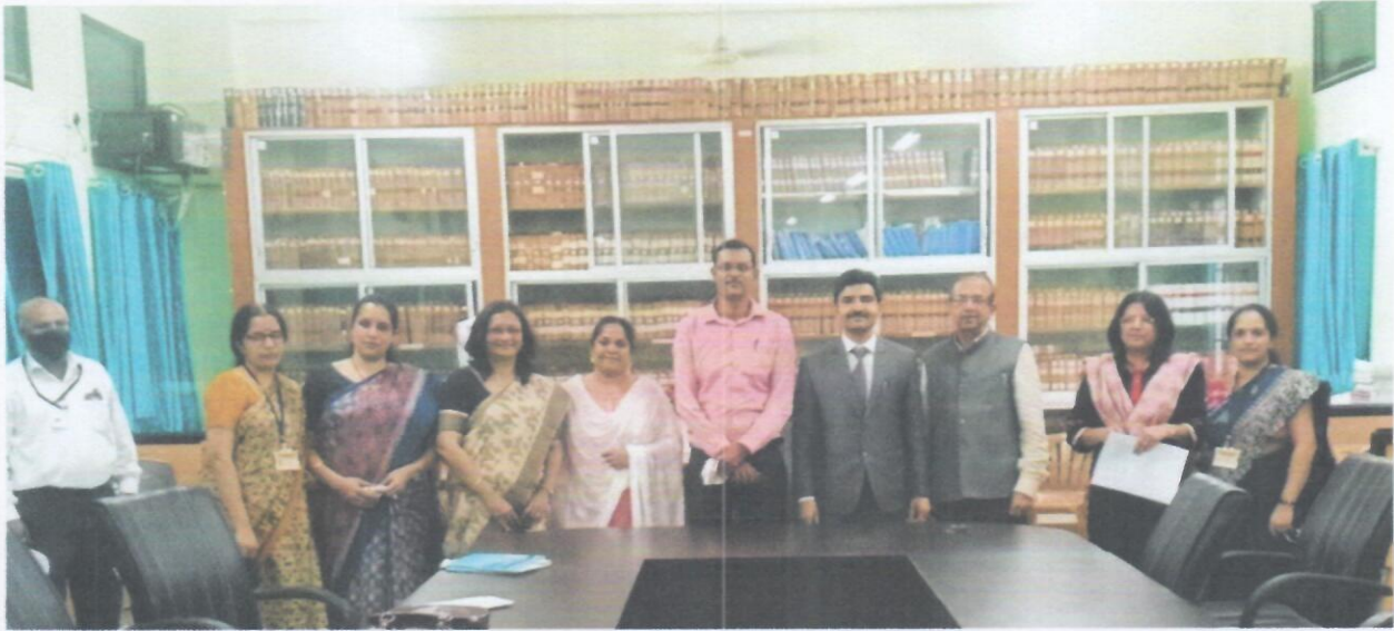
Faculty in charge attended the PAN India meeting with Secretary, DLSA, Nagpur.