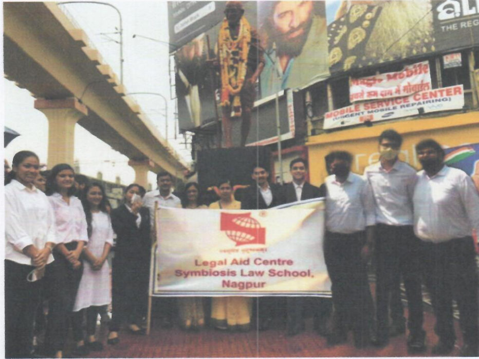
Students and faculty of all the colleges participated in the rally on 2/10/2021